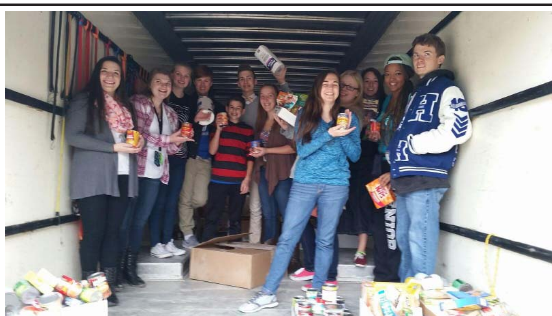
Students, staff, and community members throughout the Harrisonville School District collected more than 7,000 pounds of food for the local food pantry during the annual Trick-or-Treat So Kids Can Eat food drive. Students collected food in their schools; business and organizations partnered with the schools to collect donations as well. HHS drama students placed plastic bags on doors throughout the community and returned to collect donations. The Drama Club also collected donations at the Trunk-or-Treat on the Square event. All donations were given to the Shepherd's Staff Food Pantry sponsored by the Harrisonville Ministerial Alliance.

For the eighth year, Harrisonville Middle School hosted a Veterans Day assembly to honor local veter-